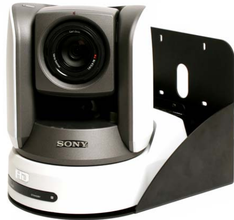
Figure 1: WallVIEW PRO Z700 System with Camera, EZIM and Wall Mount

Overall, the WallVIEW PRO Z700 is superb for a wide range of high definition shooting applications. It is also highly suitable for applications in which images are displayed on large-screen displays, such as in houses of worship, in auditoriums of teaching hospitals, in corporate boardrooms, at sporting events, tradeshow or concerts and for distance-learning applications in which clear, high definition images are required.