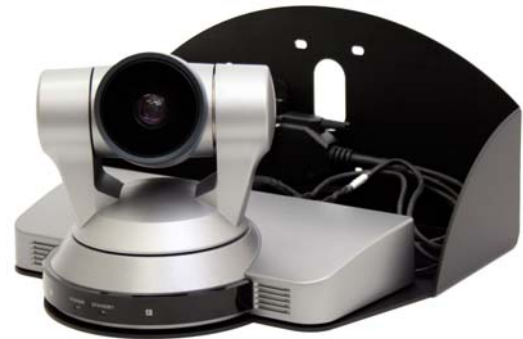
Figure 1: WallVIEW PRO HD1 System with Camera, EZIM and Wall Mount

Overall, the WallVIEW PRO HD1 is superb for a wide range of high definition shooting applications. It is also highly suitable for applications in which images are displayed on large-screen displays, such as in houses of worship, in auditoriums of teaching hospitals, in corporate boardrooms, and for distance-learning applications in which clear, high definition images are required.