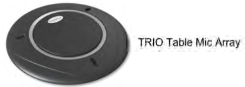
TRIO Table Mic Array