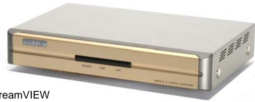
Figure 1: Vaddio StreamVIEW

General Connectivity and Compatible Camera Systems