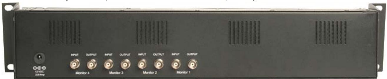
Figure 3: Back Panel of PreVIEW Quad 4 showing 2-BNC connectors (in & out) per LCD and power connector.