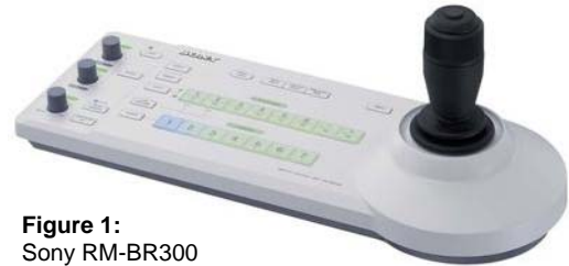
Figure 1: Sony RM-BR300 Joystick Remote Control Unit

The Sony Remote Control Joystick can control all Sony based cameras including the Pan/Tilt/Zoom functions and six presets patterns. The ergonomic joystick and feature rich control panel provide superb operability in various remote-shooting applications (Figure 1).