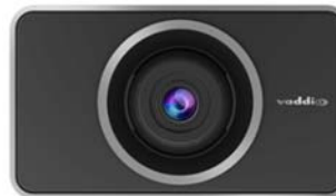
HD Camera Module