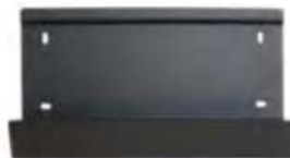
Wall Mount with Cable Tray