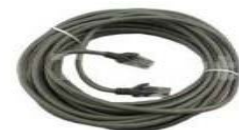
25' (7.62m) Cat-6 SSTP Cable (50' / 15.24m Available Accessory)