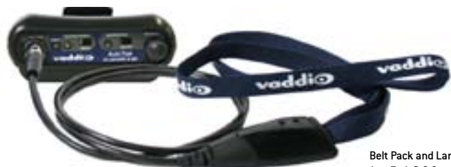
Belt Pack and Lanyard, Comes with AutoTrak 2.0 System