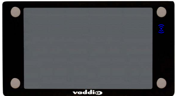
Figure 1: REVEAL IN-Wall PTZ Camera with REVEAL Glass Activated and Camera Turned Off

Significant attributes of the REVEAL include the use of a 1/3-type, 1.3 megapixel CCD image sensor for crisp clear images, 18X glass optical zoom lens and 1.8 LUX rating which works well in small or large rooms and low light environments, the IN-Wall enclosure uses the depth of the wall cavity eliminating the cameras extension into the room, and the REVEAL works with the Vaddio Cat. 5 HSDS™ cabling standard for video, power and control. The REVEAL comes in two (2) system options using the Vaddio Quick-Connect HD-18 SR or Quick-Connect DVI/HDMI and the Quick-Connect CCU HDI8 can be added. The REVEAL looks as good as it does on the inside as the outside and provides superior images for wide range of HD applications.