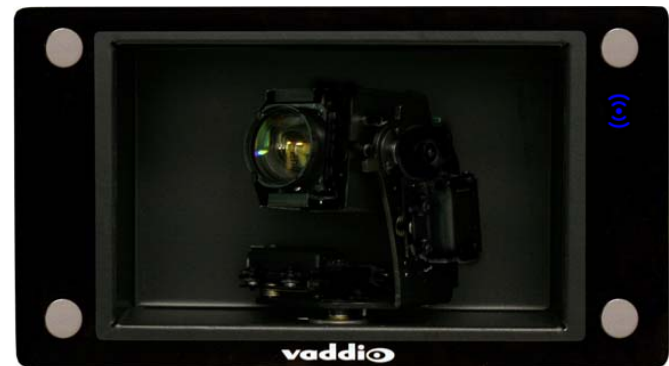
Figure 2: REVEAL IN-Wall PTZ Camera with REVEAL Glass Deactivated and Camera Turned ON (or Clear Glass Version)