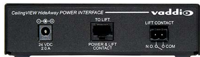
Figure 2: Vaddio CeilingVIEW HideAway Power Interface

The CeilingVIEW HideAway Power Interface uses one (1) Cat-5e cable to the CeilingVIEW HD HideAway enclosure to provide power to the motorized lift and send a lift control signal to raise and lower the lift.