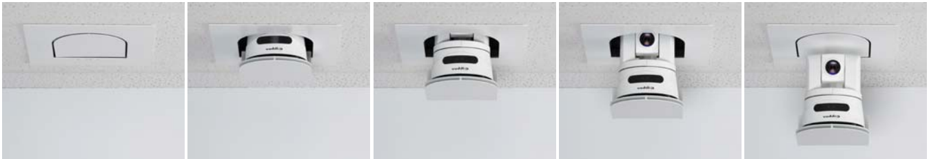
Figure 1: Vaddio CeilingVIEW HD HideAway System with a Vaddio ClearVIEW HD-18AW Camera

The Vaddio CeilingVIEW HD HideAway is a ceiling mounted motorized camera lift system that provides the ability to quietly lower a Vaddio ClearVIEW HD PTZ camera from the ceiling, retract it back into the ceiling and completely hide the camera. It is ideal for use in classrooms, boardrooms, presentation environments, video conferencing and training facilities.