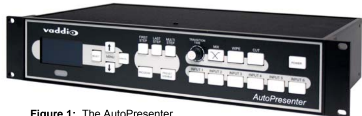
Figure 1: The AutoPresenter Automated Content Presentation System

The AutoPresenter is an outstanding camera control system and is at the core of Vaddio's Automated Content Presentation System technology. Applications for the AutoPresenter include videoconferencing, distance education, houses of worship, local government meetings and live event production.