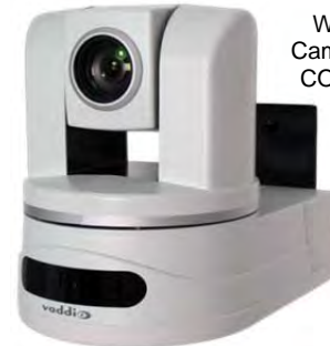
WallVIEW HD-22/30 Camera System with the CONCEAL Wall Mount ISO Down View