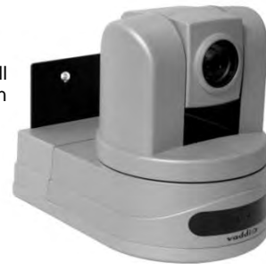
Fig. 7: Completed CONCEAL Wall Mount Camera Bracket Installation