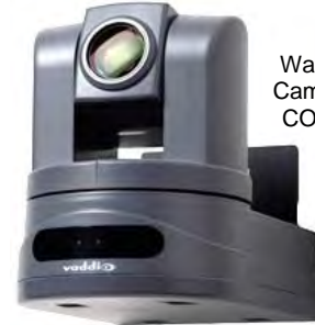
WallVIEW HD-USB SR Camera System with the CONCEAL Wall Mount ISO Up View