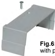
Fig.6: CONCEAL Rear Camera Cover with provided 6-32 Flat Head Screw

After successful testing of the camera, install the Conceal Rear Camera Cover on the CONCEAL Mounting Bracket with the supplied screw (see Fig. 6 and 7). Align the rear tab on the back of the mount with the screw and carefully tighten the screw. Please do not over tighten the screw.