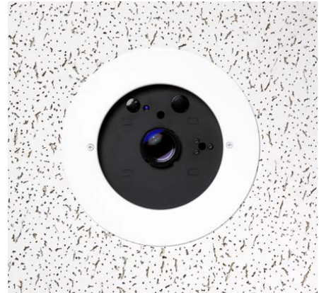
CeilingVIEW HD-18 DocCAM - Sold Separately

The CCU Image Controller was designed to provide color/image control to the CeilingVIEW HD-18 DocCAM packages. It is also can be used as an image controller for the HD-18 or HD-20 PTZ cameras used in the CeilingVIEW HD HideAway motorized lift system. This CCU Image Controller differs from the original Quick-Connect CCU in that it does not provide power to the camera, nor does it have the HSDS™ differential video I/O. The power and video are handled by the HD-18 Quick-Connect - SR Interface or the Quick-Connect DVI/HDMI - SR Interface packaged with the CeilingVIEW HD-18 DocCAM. The CCU Image Controller works in conjunction with the Control I/O of each of the Quick-Connect SR Interfaces allowing image control including Detail (sharpness), Color (red and blue gain), White Balance (auto/manual), Iris (auto/manual), Gain, Pedestal, Chroma, Gamma, Knee and allows for three (3) preset scenes.