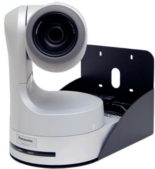
Figure 1: WallVIEW PRO HE100 System with Camera, EZIM and Wall Mount

Overall, the WallVIEW PRO HE100 is superb for a wide range of high definition shooting applications. It is also highly suitable for applications in which images are displayed on large-screen displays, such as in houses of worship, in auditoriums of teaching hospitals, in corporate boardrooms, at sporting events, tradeshows or concerts and for distance-learning applications in which clear, high definition images are required.